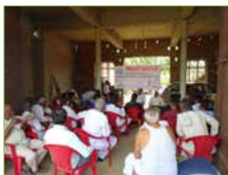
Orientation on Volunteerism and Resource Mobilization of Farmers