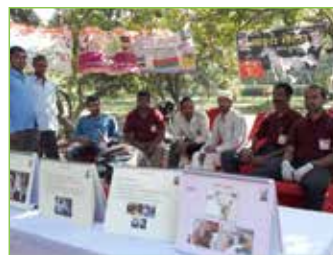
Emergency Support in Tanda Equine Trade Fair