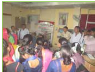
Adolescent Girls Exposure Visit to Bank