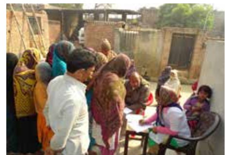
Health Check-Ups in Health Camp