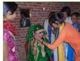
Beautician Trade Training for Girls