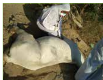
Support Euthanasia of Glander Cases at Daurala, Meerut