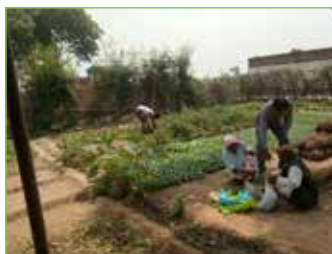
Promoting Backyard Kitchen Gardening