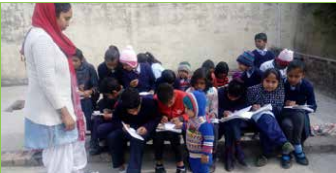
Masti Ki Kaksha on Hand Wash and Garbage Disposal