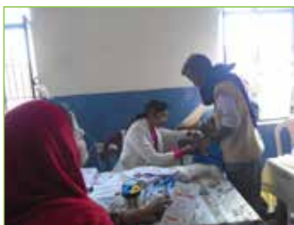
Facilitating Health Camps