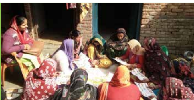
Awareness on Polio & Immunization to Mothers