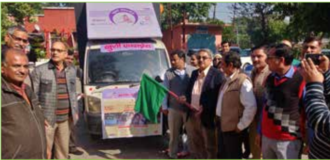
Inauguration of Info Van-Khushi Express by Chief Medical Officer, Saharanpur