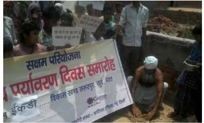
Mobilizing Tree Plantation