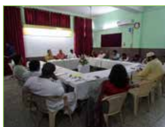
Stakeholders Meeting for Liasion & Coordination