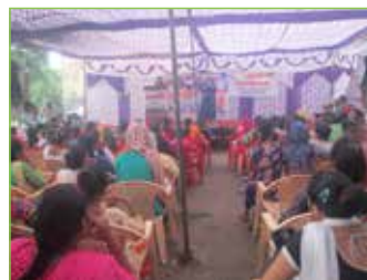
Celebration of Girl Child Day