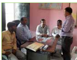
Coordination Meetings with School Teachers