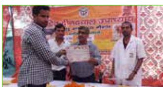
Farrier Certification Training Program with Chief Veterinary Officer at Vikas Bhawan, Muzaffarnagar