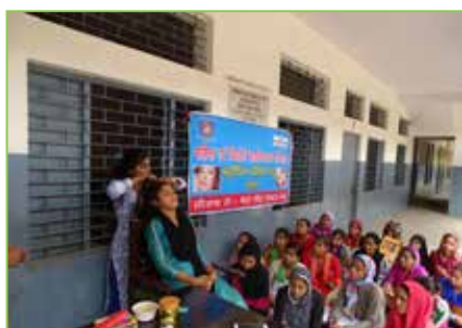
Skill Development in Beautician Trade in Rataul