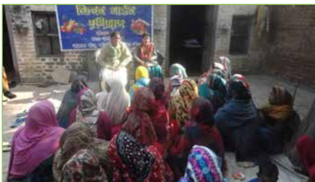
Kitchen Garden Training