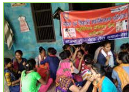
Beautician Skill Training at Lalyana