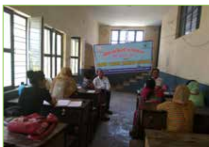
Group Leaders Training Program on Leadership and Management Skills