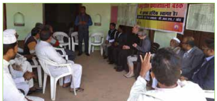
Sensitization of Community for Routine Immunization Drive