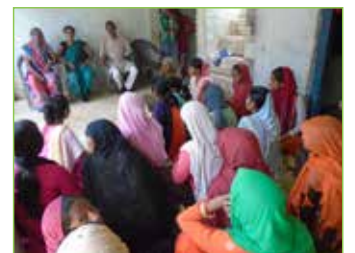
Girls Group Meeting on Govt. Schemes