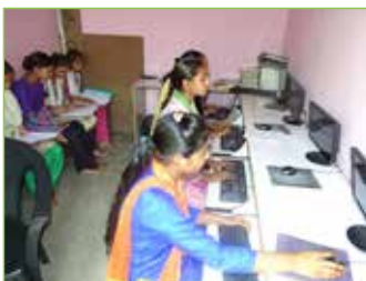
Promotion of Computer Literacy