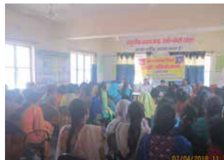
Sensitization on Health and Hygiene on World Health Day