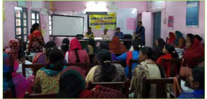
Asha Training - Capacity Building Program for Routine Immunization Strengthening