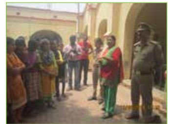
Exposure Visit to Police Station