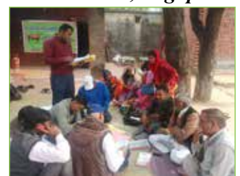
Exposure Visit Cum Federation Meeting at Badgoan, Saharanpur