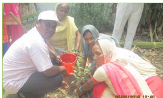
Plantation by Target Community