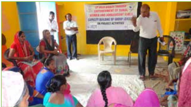
Capacity Building of Group Leaders