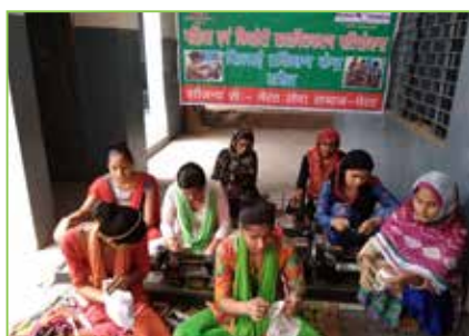
Skill Development in Tailoring in Rataul