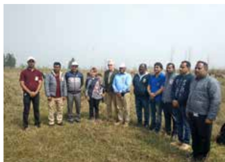
Qalander Visit at Asgripur, Meerut