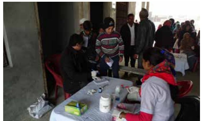
Health Camp in Village Pitholkar