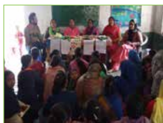
Stakeholders Sensitization Meeting