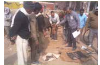
In Situ Farrier Training Program at Bulandshahr District