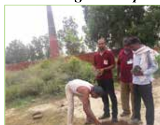
Tree Plantation at DBF Brickklyn Site at Chaprauli, Baghpat