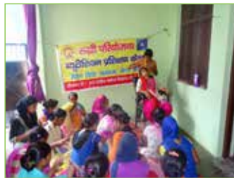
Skill Training on Beautician for Adolescent Girls