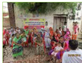
Training Program on Food Fortification and Nutrients Contents in Edible Food