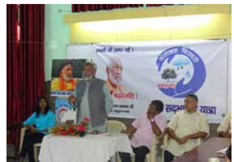
Dr. Rajender Singh (Jal Purush) Addressing on Cleaning Ganga River