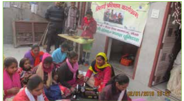
Skill Training on Tailoring