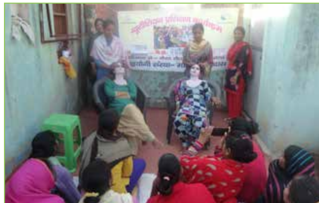
Skill Training on Beautician Trade

We have proposed a new project to the agency and it was kindly sanctioned by them. It is being implemented from May 2018. The main objective of the project is to retain the liberty of women and adolescent girls and living a dignified life comparative to their counter parts. Disseminating the knowledge through different trainings, workshops, seminars & meetings, we have strengthened the women and adolescent girls. They are becoming more sensitized and bold in breaking the social barriers and stepping forward to attain their entitlements. They are acquainting skill on computer, tailoring, beautician, vermin compost, organic farming,