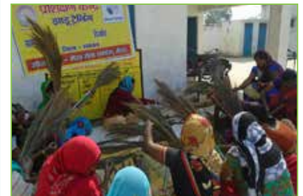
Income Generating Program on Broom Making