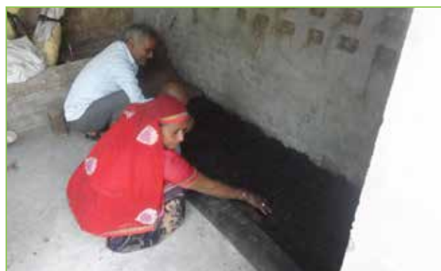
Vermin Compost Bed Preparation