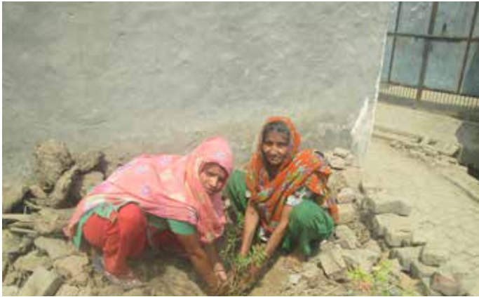
Tree Plantation by Group Members