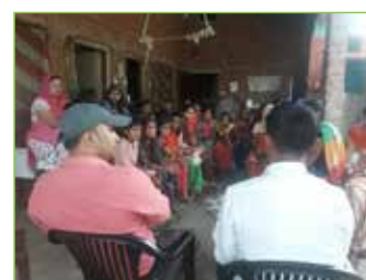
Group Orientation on WASH Activity