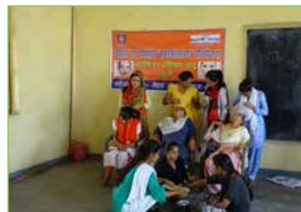
Skill Training on Beautician in Loni