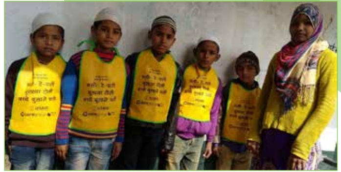
Awareness Generation through Bulawa Tolly