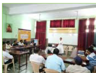
Project Orientation of Samvaad Project Staff