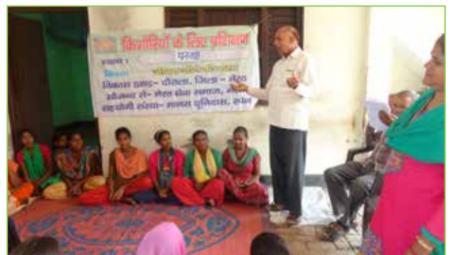
Life Skill Training Session for Girls