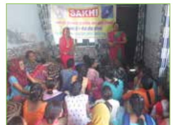
Training on Puberty Changes in Adolescent Girls