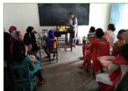
Adolescent Girls Monthly Meeting