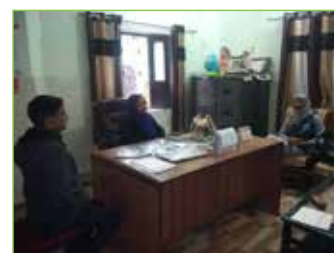
Meeting with School Principal Jainibiya Girls Inter College Khalapaar