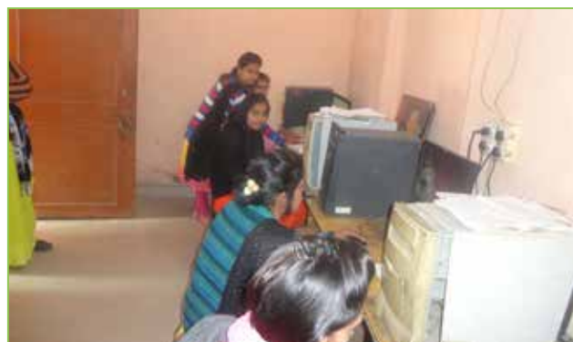
Basic Computer Training for Girls