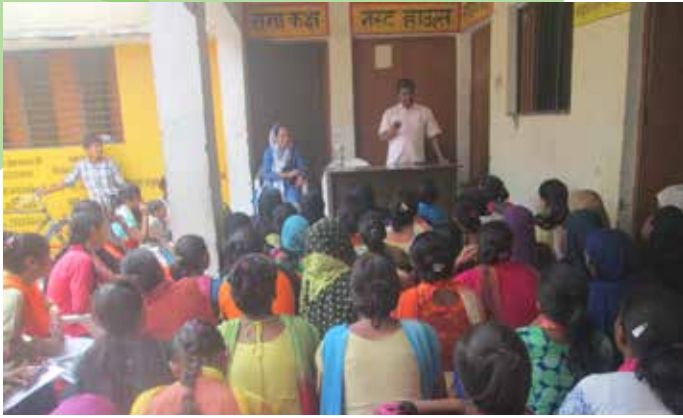
Environment Day Celebration