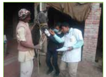
Treatment of Equine at Meerut District