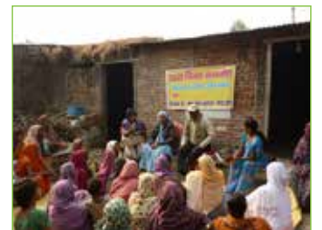
Awareness Generation on HIV-AIDS