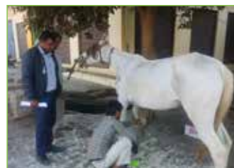
Mentoring Hair Clipper for Welfare Friendly Handling and Restraining Techniques