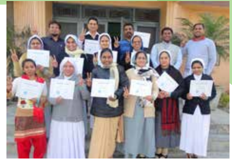
Certification Program on Vitamin A