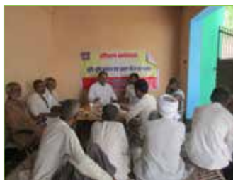
Farmers Training Program on Land & Seed Management