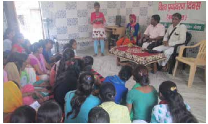
Awareness on Environment on Environment Day