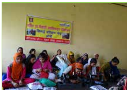
Tailoring Skill Training at Loni