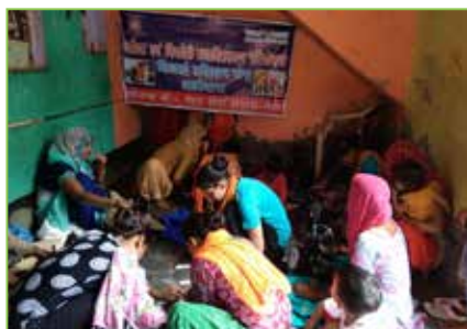
Tailoring Skill Training at Lalyana