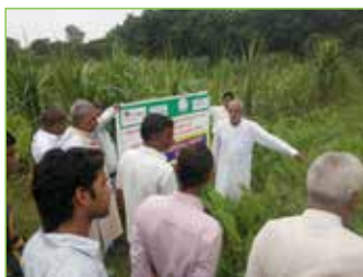
Farmers Exposure Visit in Beeta Village