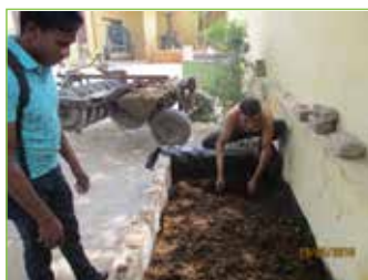
Promotion of Vermin Compost Bed for Organic Farming