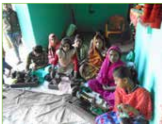
Skill Training on Tailoring