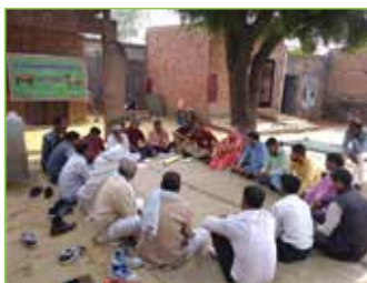
Association Leaders Exposure Visit to Saharanpur