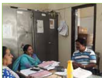
Meeting and Liasing with AWW Supervisor