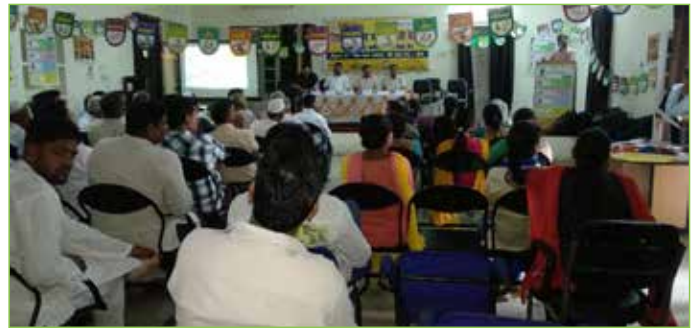
District Level Inteface Meeting