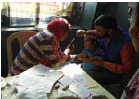
Support in Routine Immunization of Children