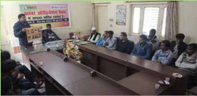
Workshop with Barbers for Awareness Creation on Polio