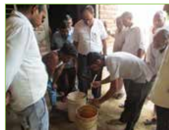
Decomposer Preparation Training Program for Farmers