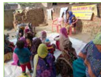
Awareness on Govt. Schemes to Women Group