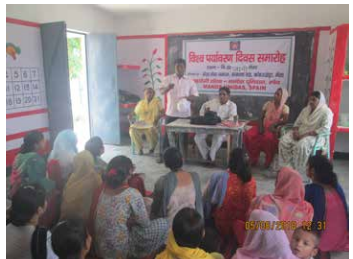
Sensitization Meeting on Environment Day