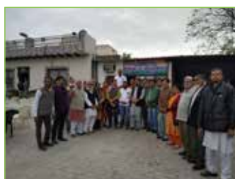
Paigam A Insaniyat