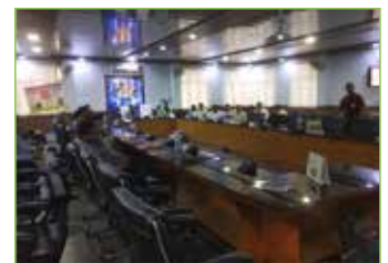
Government Veterinary Officers Workshop on Glander Disease at Collectorate, Baghpat