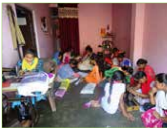
Skill Training on Tailoring Trade