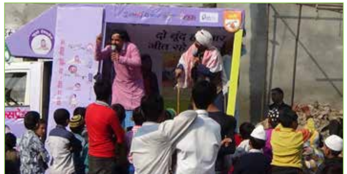
Awareness Generation on Polio by Nukkar Natak