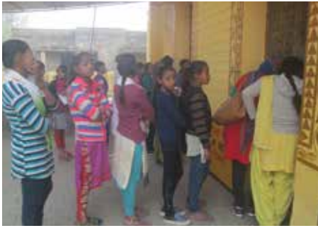
Registration of Adolescent Girls for Hemoglobin Test