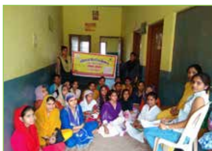
Life Skill Training Program