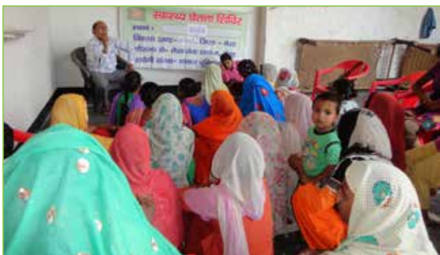
Health Awareness Camp