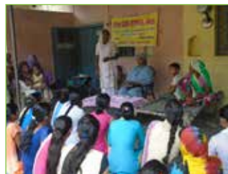
Life Skill Training Session for Girls