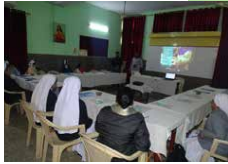
Training of Nurses on Vitamin A