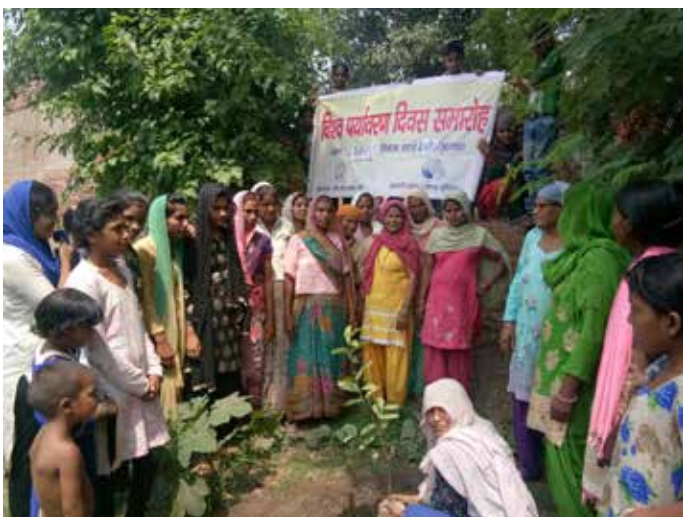
Tree Plantation on Environment Day