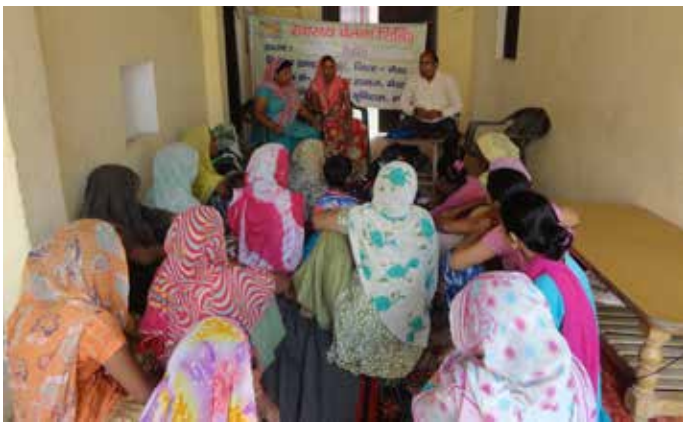
Health Awareness Camp on Communicable Diseases