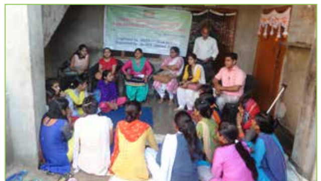
Training on Puberty Changes and Legal Literacy