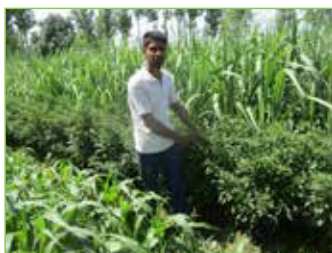
Organic Farming Mix Cropping-Sugarcane & Chilli