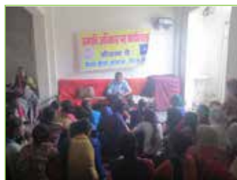
Training on Property Right of Adolescent Girls