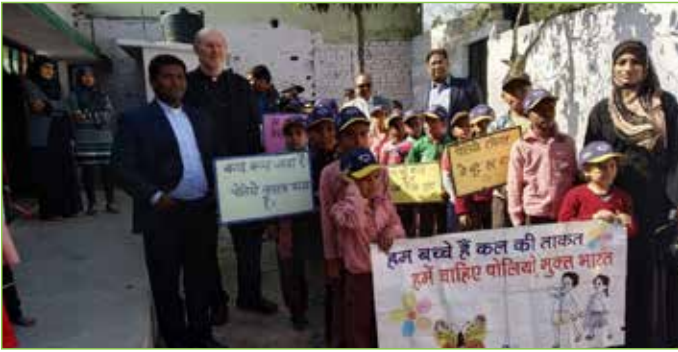
Mobilization through Children Rally