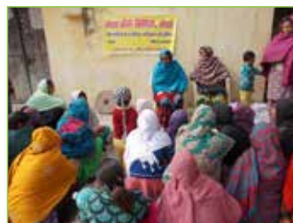
Awareness on Puberty Changes