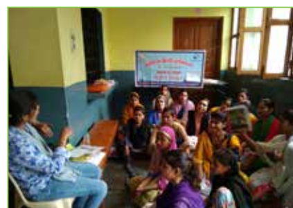
Sensitization of Girls on Health and Hygiene