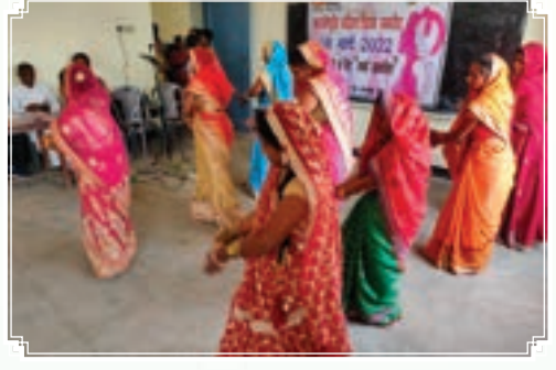
Performance of Women's Day celebration